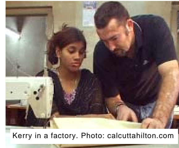
Kerry in a factory.

Most of the women in this district can neither read nor write. This means they can't read the signs that would allow them to catch a