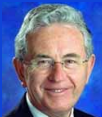
Dr Michael Cullen, Finance Minister